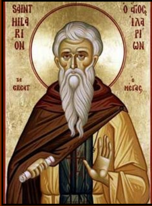
St. Hilarion Pray for us!