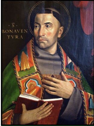
St. Bonaventure Pray for us!

July 9: St. Veronica Guiliari (1660-1727). A long time before she died, this Franciscan ‘mystic of the passion’ drew a picture of her heart that showed where the Lord had imprinted the instruments of the passion. A post-mortem showed objects in the right ventricle that corresponded exactly. Her case is the most remarkable of mystical phenomena.