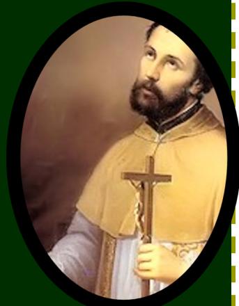
St Peter Claver