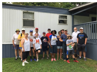
House Repairs, Dunbar, PA 2016