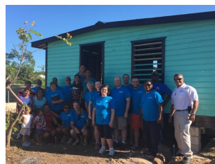
Belize City 2017