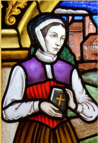
St. Margaret Clitherow, Pray for us!

Mar 23: St. Turibio of Mogrovejo (1538-1606) was a contemporary and the holy reforming bishop of Lima Peru as Charles Borromeo was for Milan, Italy; he personally baptized and confirmed 500,000 – including Rose of Lima and Martin de Porres. And Bd. Rebecca (or Rafqa) Al-Raves (1832-1914) was a Lebanese religious sister who united her sufferings to the passion of Christ for 29 years as she asked to be afflicted by painful illness.