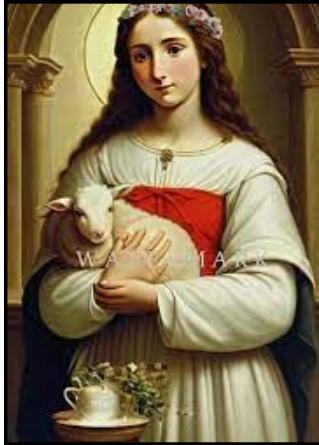
St. Agnes Pray for us!

Jan 15: Bd. Arnold Janssen (1837-1909). German founder of the Divine Word Missionaries spread the faith from China, to New Guinea to Togo then South America: all because he had to flee Bismarck’s kulturkampf.