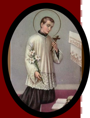
Saint Aloysius Gonzaga