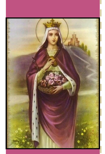
<u>St. Elizabeth of</u> <u>Hungary</u> Pray for us!