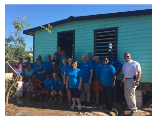
Belize City 2017