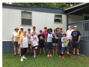
House Repairs, Dunbar, PA 2016