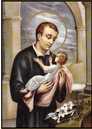
St. Stanislaus, Pray for us!

August 11: St. Clare of Assisi (1193-1253. When I pray at her tomb (four times now) I just start crying. A purity and ferocious sense of dignity overwhelms me. She is very present. We will venerate her relic this day.