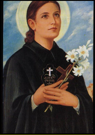
St Gemma Galgani Pray for us!

April 8th: St Julie Billiart (1751-1816) founded the teaching sisters of Notre Dame de Namur in Belgium and Northern France. She had been miraculously healed at a novena after 22 years as an invalid when the priest said “if you have faith, take a step in honor of the Sacred Heart.” One of my favorite of her quotes is “better mistakes than paralysis”