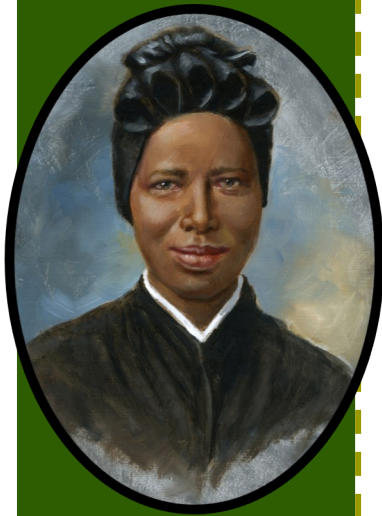
St. Josephine Bakhita

Feb 7: St. Richard, “pilgrim king” (720 ). I prayed at his tomb at San Frediano’s church in Lucca. He and his two sons travelled from England to Rome on pilgrimage; the father died here. Then the extraordinary miracles happened at this tomb defied description.