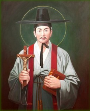
St. Andrew Kim

St. Januarius (305) ! San Gennaro! He is the beloved martyred Bishop of Naples, most famous for the liquefying of his blood. We'll see today if his blood boils what with the current state of the Church!