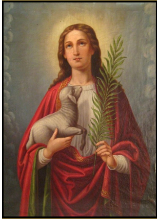
St. Agnes Pray for us!