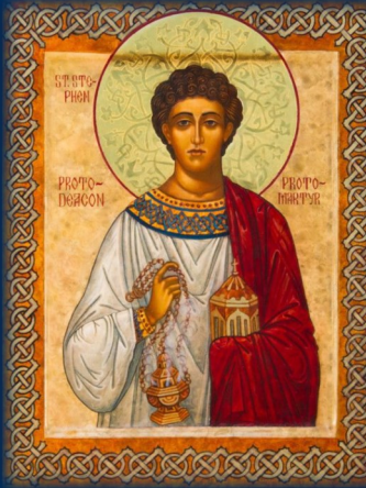
St. Stephen Martyr

Dec 26: St. Stephen Martyr (34+) was a Hellenist Jewish deacon of the earliest church in Jerusalem (his name Stephanos in Greek means crown) was stoned to death for his bold proclamation of the gospel. His tomb was rediscovered in 415 and the church has celebrated this feast on this day from these ancient times.