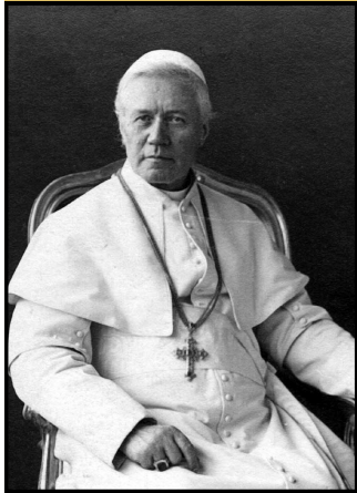
St. Pius X, Pray for us!

Second Council of Lyons in 1274 to the astonishment of all.