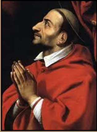
St. St. Carlo Borromeo