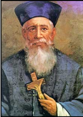
St. Francis Régis Clet Pray for us!

Feb 13: Bd. Jordan of Saxony (1177- 1237). The German second-in-command of the Dominican Order, provided significant material on St. Dominic but has also left detailed insight into his personality through a series of letters written to Bd. Diana d' Andalo (whose relics we venerate in Bologna).