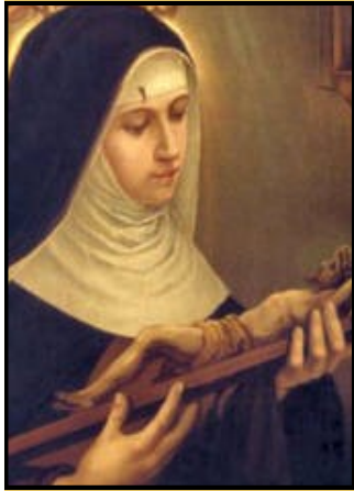
St. Rita of Cascia, Pray for us!

Celestine (1210-1296) is the first pope to retire, and was a special patron for Pope Benedict XVI for obvious reasons. A hermit priest, Peter founded a group of Benedictine style hermits called 'Celestines', and was appointed pope at the age of 85. He was utterly unworldly and politically naïve. He simply quit and told the cardinals to get back to work.