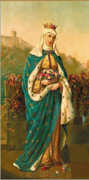
St. Elizabeth of Hungary

For everything there is a season, and a time for every purpose under heaven: a time to be born, and a time to die; a time to plant, and a time to pluck up that which is planted. A time to love, and a time to hate; a time for war, and a time for peace.