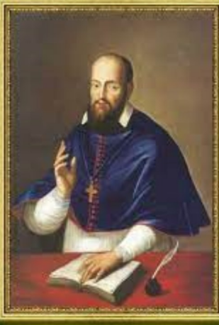
St. François de Sales

Jan 24: St. François de Sales (1567-1622). Oh my! The spiritual giant from Annecy (just southwest of Geneva) oversees conversions on a massive scale in the Chablais and Thonon. An entire Calvinist region of 60,000 was won back to Catholicism through this one man. He would credit the mystic Mme. Barbe Acarie or St. Jeanne de Chantal for his success. He loved pilgrimages and prayed at the tomb of St. Charles Borromeo in Milan; his sweat and tears are on the shroud of Turin. His last words? “Humilité” – written 3 times on a scrap of paper. Visit his relics in Annecy!