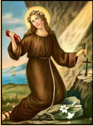
St. Rosalia of Sicily Pray for us!

September 3: St. Gregory the Great (540-604). Pray that we get other popes like this guy. I pray at his tomb at the Vatican and at his family mansion on the Coelian Hill when in Rome. Nobody writes like him – I like his style better than that of Augustine. His letters are so warm and intelligible.