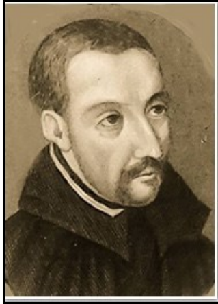
St. Robert Southwell, Pray for us!

Feb 17: 7 Founders of the Servite Order (13th century) were a great group of men from Florence who were bound together out of love for Mary, under the title of Our Lady of the 7 Sorrows. But what about the martyr St. Francis Régis Clet (1748-1820)? A Lazarist priest from Grenoble who worked for 30 years in the interior of China in Wuchang, in the province of Hupeh. He was tortured and slowly strangled to death at the age of 72. I was given his relic which I will always expose for veneration on this day.