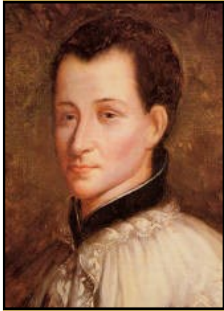
St. Claude de la Colombiere, Pray for us!

Feb 10: St Scholastica (547) twin sister of St. Benedict of Nursia is really known from one story: how she asked God for inclement weather, so as to prolong the sweet spiritual conversation she was having with her brother, just before her death. I visited her tomb in Monte Cassino three times.