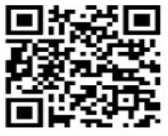
Scan to purchase Tickets

An affordable High School in the Catholic Tradition