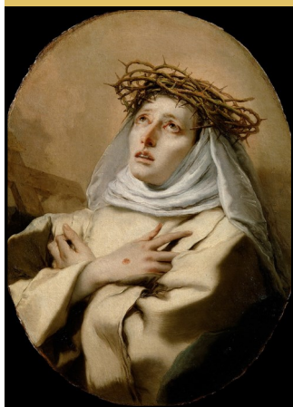
St. Catherine of Siena, Pray for us!

For everything there is a season, and a time for every purpose under heaven: a time to be born, and a time to die; a time to plant, and a time to pluck up that which is planted. A time to love, and a time to hate; a time for war, and a time for peace.