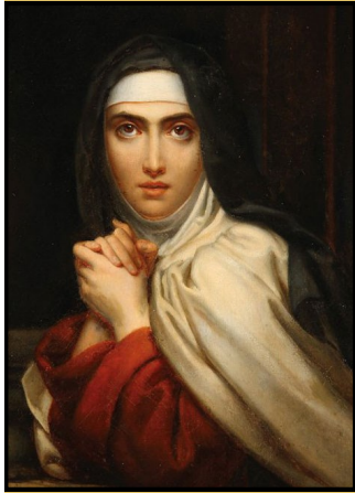
St. Teresa of Avila Pray for us!

October 14: St. Callistus I (222+) was a slave known for trouble with banks and brawling in synagogues. He was sentenced to hard labor and freed finally by the Emperor's mistress (Marcia!) only to become the Pope and serve for 5 years. His tomb was rediscovered in 1960(!)