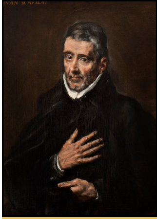
St. John of Avila, Pray for us!

May 6th: St Francois Laval de Quebec (1623-1708) was a distinguished French priest who couldn't reach Vietnamese missions so he was appointed to Quebec missions instead. He fought for 49 years in brutal pioneer Quebec to assist the "first peoples", build a seminary as first bishop to the city. We prayed at his tomb in the Cathedral.