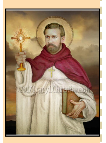
St. Raymond Nonnatus Pray for us!