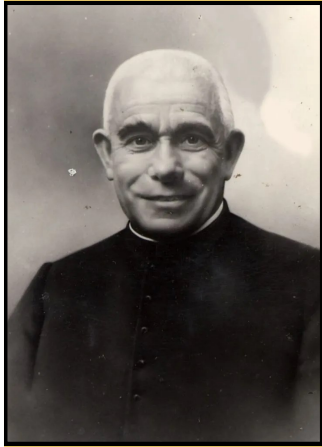
St. Luigi Orione Pray for us!

Mar 11: St. Sophronius (550-639). Patriarch of Jerusalem, cultured, open-minded and passionate about orthodoxy. Negotiated the surrender of Jerusalem with the Saracens to avoid the massacre of the population; he dies a few months later.