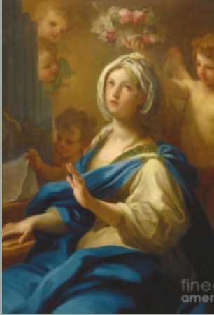
St. Cecilia, Pray for us!

Nov. 21: St. Gelasius I (496+) I like popes who write about the importance of bishops who have a “duty to devote ¼ of their income to charity”. St. Albert de Louvain (1166-1192) was the bishop of Liege who was butchered by German knights at the direct request of the Emperor Henry VI. His relics are in the Carmelite church in Bruxelles.