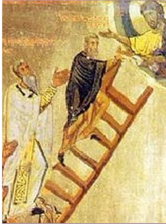
St. John Climacus

Mar 30: St. John Climacus (7th century) is an old friend – a monk from the age of 16 on Mount Sinai: he was stigmatized as a chatterbox – so deeply did he desire to share his insights in spiritual direction with the multitude who would approach. In art he is shown with a ladder (klimax is the greek work for ladder) as he trained monks – step by step – rung by rung to climb to holiness.