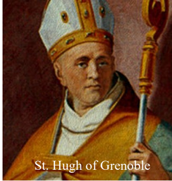
St. Hugh of Grenoble

would live and work for many years to come. St. Leonard was quickly healed and worked till 1900!