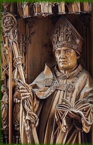
St. Wolfgang von Regensburg

Zealous, reforming bishop, but I just like the name, "Wolfgang;" his relics are in the Cathedral.