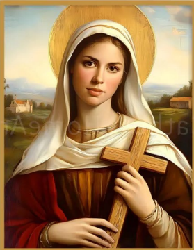
St. Genevieve de Paris, Pray for us!

Dec 29: St. Thomas à Becket (1118-1170). The conversion of this worldly chancellor into a holy Archbishop of Canterbury is extraordinary. He was assassinated in his own cathedral and became the shining model for all clerics who challenge worldly political power. King Henry the VIII quickly destroyed his shrine in 1538 for fear that it would inspire other upstarts/traitors!