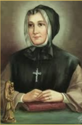
St. Margaret d'Youville, Pray for us!

Dec 23: St. Margaret d'Youville (1701-1771) an unhappily married frontier woman (her husband was a fur trader who illegally sold booze to the Native Americans). She seemed caught on fire for the faith when her husband died. She became a religious sister of a new congregation: “les sœurs grises”.