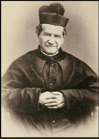
St. John Bosco, Pray for us!

Jan 27: St. Angela Merici (1470-1540) grew up on the banks of Lake Como who took a pilgrimage to the Holy Land – lost her eyesight in Crete but finished the pilgrimage blind. Her eyesight was miraculously restored back in Crete (!) and on her return she went on to found the “oldest and most considerable teaching order in the Catholic Church” – the Ursulines.