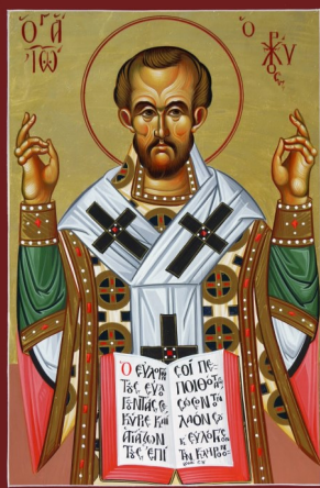
St. John Chrysostom

September 12: St. Guy of Anderlecht (1012) was a sacristan, and a wanderer: We honor all the Guys of St. Mary's County who carry his name.