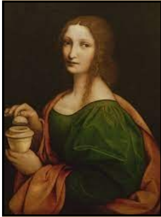
St. Mary Magdalene Pray for us!

July 20: St. Apollinaris. Centuries after his death, he appeared in a vision to Saint Romuald and revealed himself as the first bishop of Ravenna and martyr for the faith. His apse mosaic depiction in Chasse is nothing short of breathtaking. In 1969, he was taken off the calendar but good old St. JP II put him back in 2002.