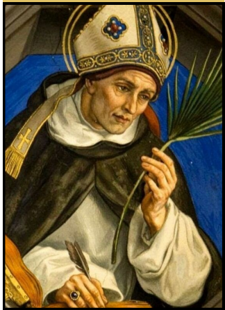
St. Albert the Great, Pray for us!

Nov. 11: St. Martin de Tours (336-397) ‘the glory of ancient Gaul and a light to the Western Church in the 4th century’ had a great biographer in the person of Sulpicius Severus. Born in Hungary, educated in Pavia, conscripted soldier in Amiens, famous exorcist, and then a glorious bishop in Poitiers; he is the one made famous for cutting his army cloak on a freezing winter day and clothing a half-naked beggar who was indeed ‘Christ in disguise’. He is the patron saint of military chaplains.