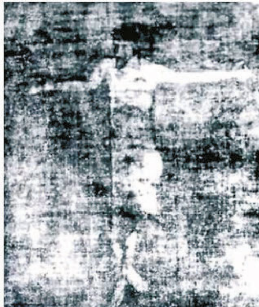
The Crucified Christ is clearly distinguished under ultra violet lighting.

One of the most complete documents about Eucharistic Miracles is the Eucharistic Miracle of Walldurn, Germany, in 1330. The Monk Hoffius documented the miracle in 1589. During the Mass, a priest accidentally overturned the consecrated wine onto a corporal. The Blood of Christ transformed into an image of the Crucified Christ. The relic of the corporal with the Blood is preserved and placed on the side altar in the Minor Basilica of Saint George in Walldurn. Every year, thousands of pilgrims visit Walldurn to venerate the sacred relic.