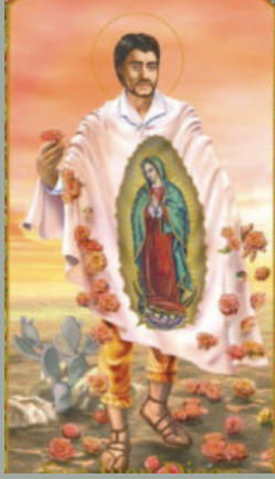
St. Juan Diego, Pray for us!

For everything there is a season, and a time for every purpose under heaven: a time to be born, and a time to die; a time to plant, and a time to pluck up that which is planted. A time to love, and a time to hate; a time for war, and a time for peace.