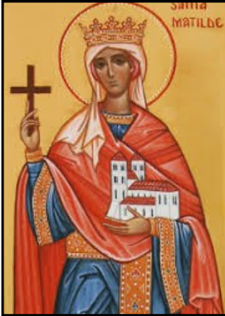
St. Matilda Pray for us!

Mar 11: St. Sophronius (550-639). Patriarch of Jerusalem, cultured, open-minded and passionate about orthodoxy. Negotiated the surrender of Jerusalem with the Saracens to avoid the massacre of the population; he dies a few months later.