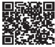
Scan for Promo Video