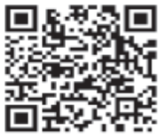
Scan to Register

ENDS AUGUST 30TH! $90.00 Per Person Registration until September 29th 2023