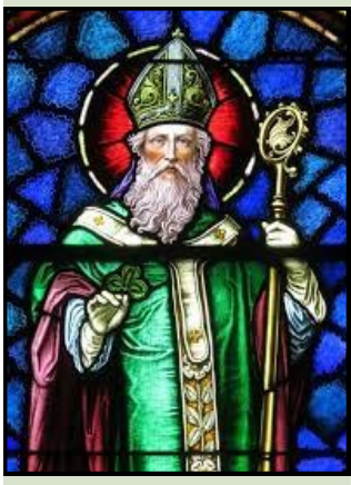
St. Patrick Pray for us!