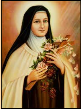
St. St. Thérèse de Lisieux Pray for us!

September 25: St. Vincent Strambi (1745-1824) became a Passionist priest and bishop, known for his insistence on all priests singing Gregorian chant. The result: a genuine liturgically-based fervor in his diocese.