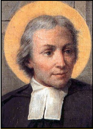
St Jean-Baptiste de La Salle Pray for us!

April 7th: St Jean-Baptiste de La Salle (1651-1719) was the French cleric who founded the Christian Brothers congregation initially as free schools for the poor in Rouen. In the 1950s there were 16,000 brothers continuing his work.