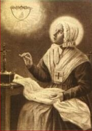
Bd. Anna Maria Taigi

June 6: St. Norbert (1080-1134) was a blasé nobleman till he was knocked off his horse in a violent thunderstorm. The conversion was sudden and complete. He sold everything and went to Rome to confess his misdeeds to the pope himself. He founded the Premonstratensians and his relics were preserved from Lutheran Magdeburg by moving them to Catholic Strabov.