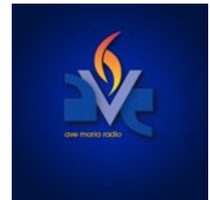
Ava Maria Radio