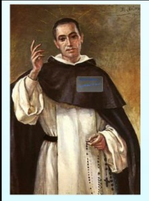
St Michael de Sanctis Pray for us!

April 8th: St Julie Billiart (1751-1816) founded the teaching sisters of Notre Dame de Namur in Belgium and Northern France. She had been miraculously healed at a novena after 22 years as an invalid when the priest said “if you have faith, take a step in honor of the Sacred Heart.” One of my favorite of her quotes is “better mistakes than paralysis”