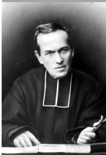
Bd. Antoine Chevrier