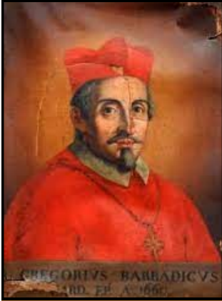
St. Gregory Barbarigo Pray for us!

June 18: St. Gregory Barbarigo (1625-1697). Talk about life styles of the rich and famous! This wealthy Venetian gave it all away: 800,000 crowns. On some level, he is the archetype of the saintly philanthropist.