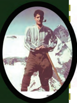
Bd. Pierre Giorgio Frassatti