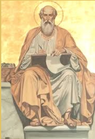
St. Julius the Veteran, Pray for us!

May 25th: St. Gregory VII Hildebrand (1021-1085) Pray at his tomb in Salerno and read about his boldness in dealing with secular power. A champion of Church liberty and priestly holiness.