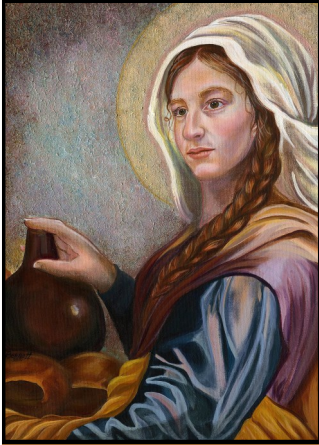
St. Zita Pray for us!

(1673-1716) is the fervent priest with the greatest love for our Lady -- as evidenced by his copious books, poems and hymns. I said Mass on top of his tomb in St. Laurent-sur-Sèvre and have his full works in French. And St. Gianna Beretta Molla (1922-1962) was the physician turned ‘mother of all Milan’ for her willingness to give up her life so that the child in her womb could live. Visit her grave in the cemetery right outside the airport in Western Milano. Numerous children around the world are now named ‘Gianna’ in her honor – including several from our parish.